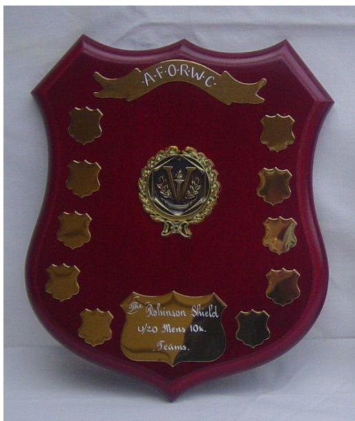
The original (left) and current (right) Robinson Shields

Initially, the Robinson Shield was contested alongside the Glover Shield, both races being held concurrently as part of a 10,000m Track walk. In 1965, the combined race was changed to a 10km road walk.