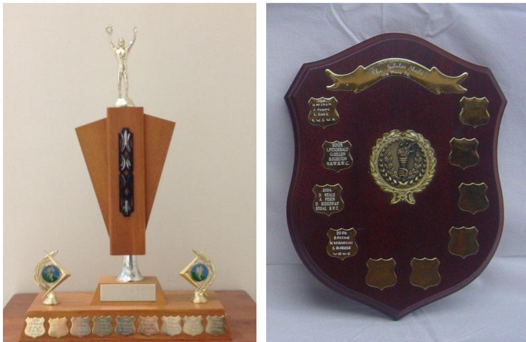
The original Jubilee Shield (left) and its more recent version (right)

In 2008, it was rebadged as the Nathan Deakes Trophy.