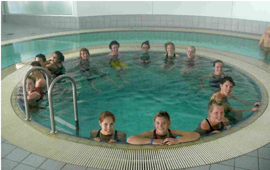
In the cold plunge pool after training – brrrrr.....