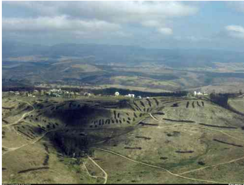
Mt Stromlo in January 2004 - a year after the fires – the white observatory buildings stand stark against the denuded slopes

Of course, it looks a lot different now. Up to 6 years ago, the mountain and surrounding areas were heavily wooded with pine plantations and the walk had its own special magic. When the infamous firestorm swept through Canberra on 18 th January 2003, taking 400 homes and two lives along the way, the Mt Stromlo area was completely engulfed and Australia's oldest active observatory, atop the mountain, was extensively damaged. Helicopter observations revealed its handful of giant domes as either burnt to the framework or molten masses of metal.