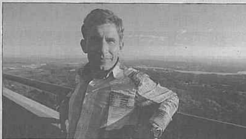
GOLDEN BOY: Korzenioski won Olympic titles in Atlanta, Sydney and Athens.

Considered one of the greatest Olympians of all time having won gold in Atlanta, Sydney and Athens, Korzenioski was invited to represent Poland in the Kosciuszko Run