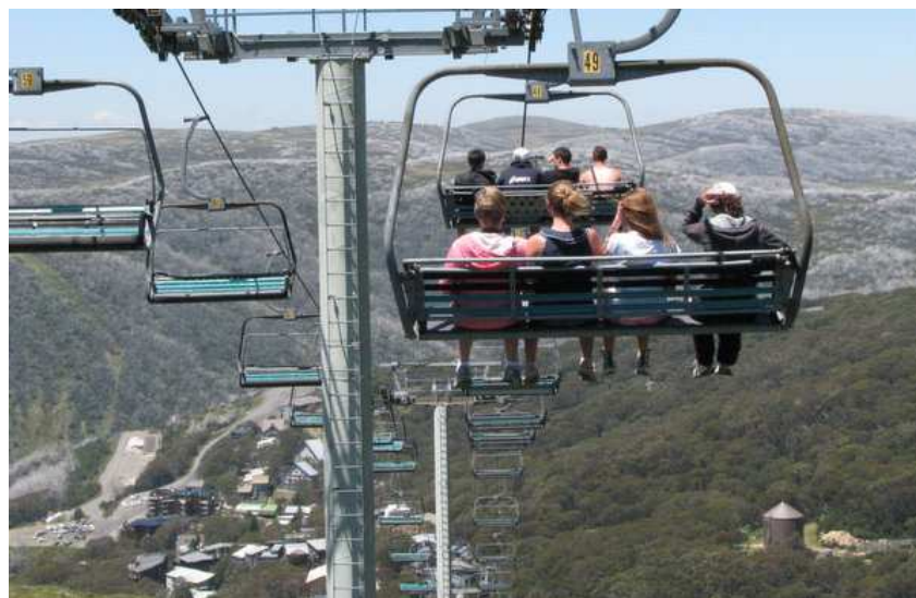
Up to the top of the range via chairlift

And a few photos to mark the first few days of camp activity.