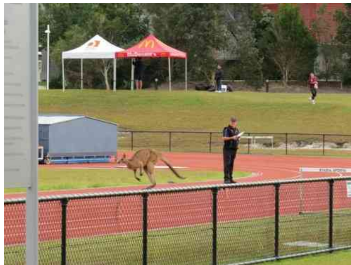
Careful - kangaroo on the track!

TOWER INSURANCE ISLE OF MAN 100 MILE WALK, ISLE OF MAN, 3-4 AUGUST 2013