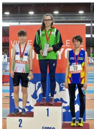
Podiums: Junior Man and Junior Women