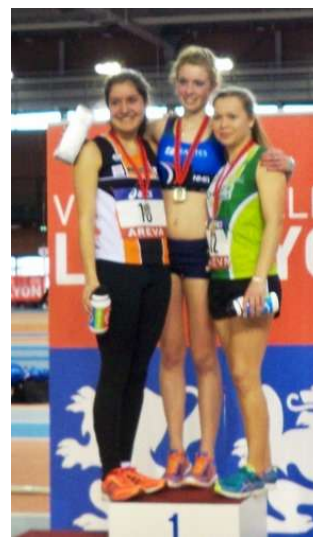
Podiums: U23 Women, U23 Men and U18 Women