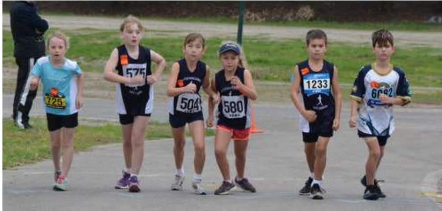
Start of the U9 1km event