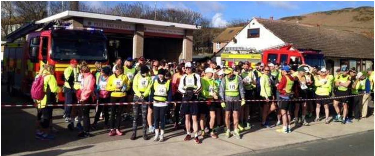
The event starts outside the Peel Fire Station