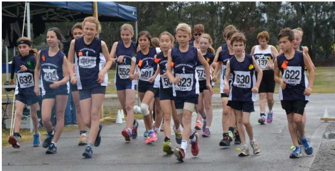
The start of the 1km and 2km races – what a great field of young and not so young walkers!