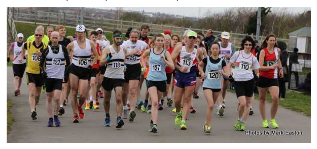
The events get underway – what a great field!