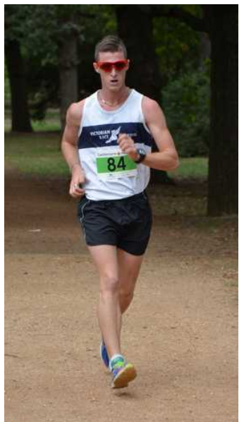
Thanks to Terry Swan for photos - <a href="http://www.vrwc.org.au/coppermine/thumbnails.php?album=67">http://www.vrwc.org.au/coppermine/thumbnails.php?album=67</a>.