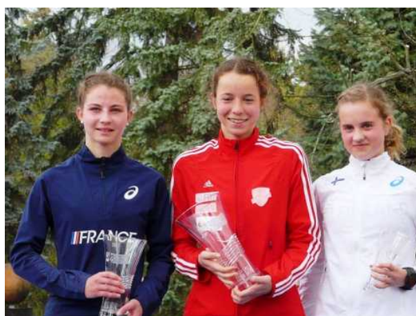
U20 podiums