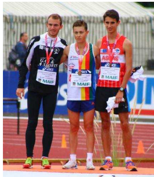
U20 Podiums in the French Underage Championships last weekend