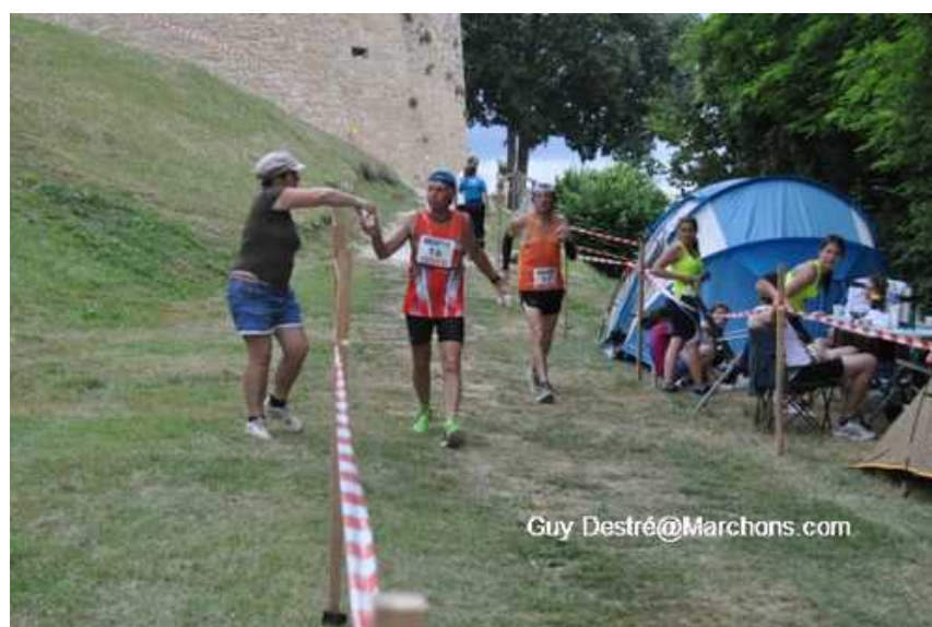
What does up must come down – a tough course in Montguyon

https://photos.google.com/share/AF1QipMzrjM2EnfHMhLrHWpEFFbGSEoc6NjSQoCJdv7zCkewzbpA2k2c49wz5oZnpaz3nA?hl=fr&key=aWpJdzBULXVZLUVEVF9iWGND0GhLVzZVX11URWiB .