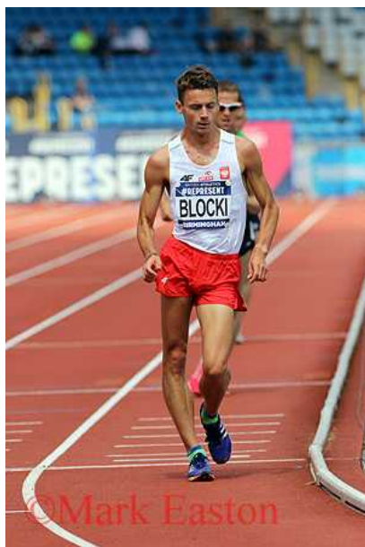
Tom Bosworth, Callum Wilkinson and Adrian Blocki