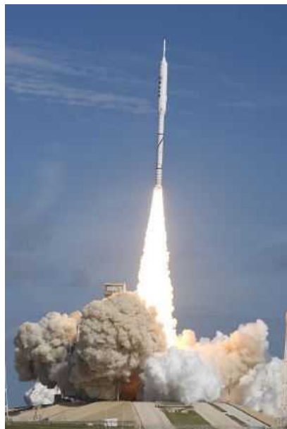
Straight Knee But Loss of Contact - NASA's Ares Rocket

I wanted to call this article, Validation of Overflow for Computing Plume Effects during the Ares I Stage Separation Process , but that title had already been taken by some NASA aerospace engineers who authored a conference paper in 2011 to describe issues that arise when launching an Ares rocket into space ( Validation of Overflow for Computing Plume Effects during the Ares I Stage Separation Process.pdf ). The lead author of the paper was Goetz Klopfer, a first rate rocket scientist whose resume is outright impressive: a bachelor's of science degree in mechanical engineering from Wayne State University (Michigan), a master's and graduate degree in engineering from Stanford University and a Ph.D. in engineering from the University of California, Berkeley.