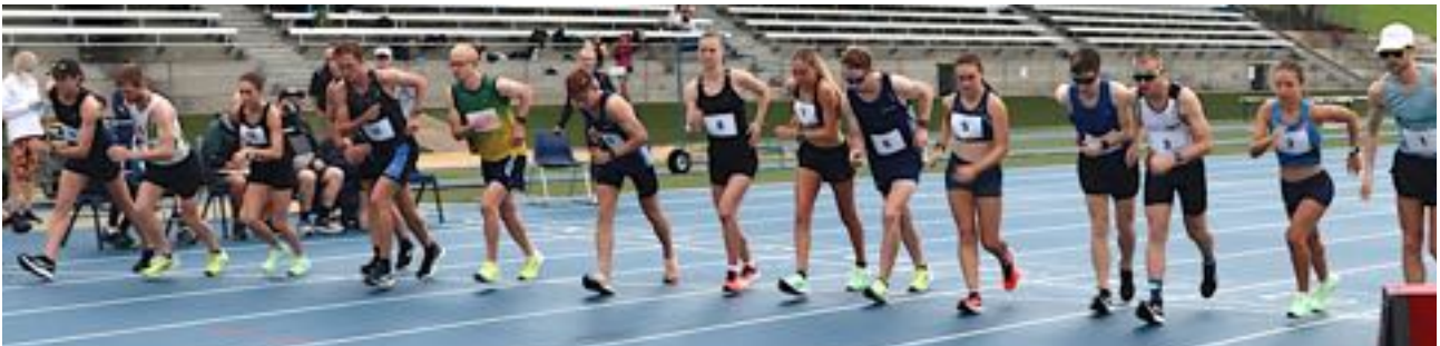
As the gun sounded, the clouds cleared and the walkers were off for 25 laps of the AIS track.

https://open.spotify.com/playlist/2MHa0zZUThRyRL8hvNvtll?si=Tr--h5aKT52cTEd7PIotsg&utm_source=copy-link