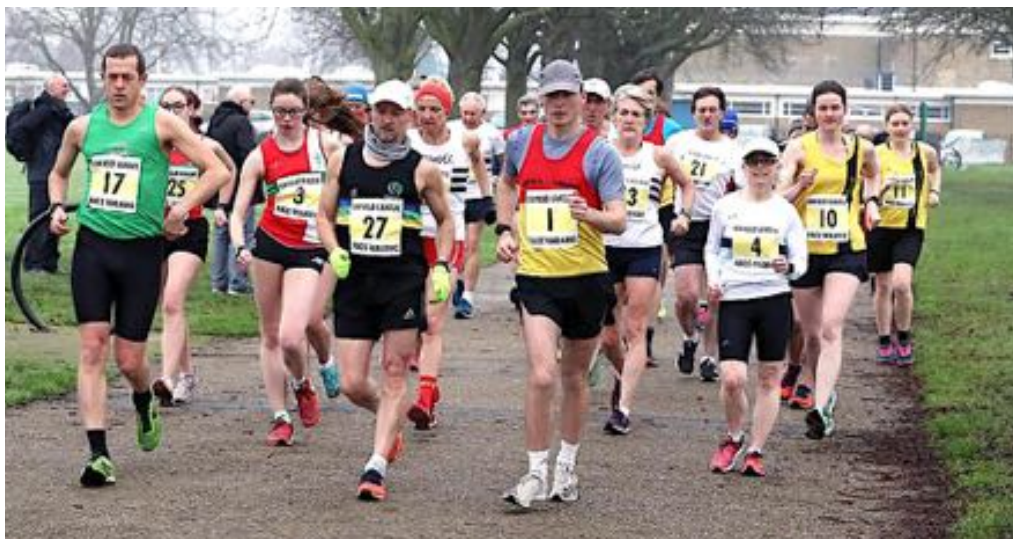
Getting 2022 underway at Enfield