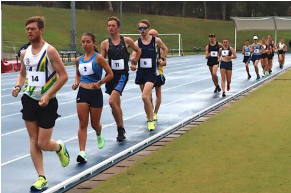
The field spread out relatively quickly with the open walkers breaking away.