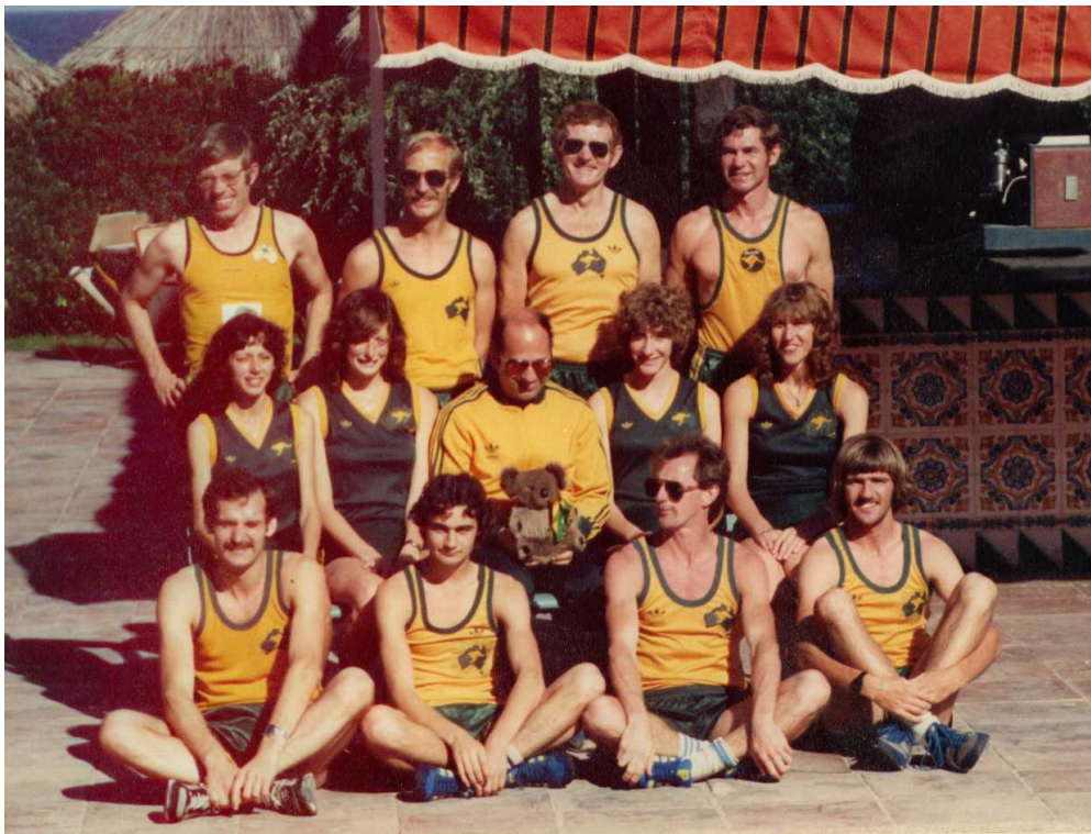
1981 Lugano Cup Team

His last Australian title was the 1980 20 km. He continued to race into 1981 but was nearly 40 years of age by now and realized it was time to step back and let the younger generation take over. His last fling was when he was selected in the Australian team for the 1981 Lugano Cup (his second for Australia and his fourth overall). On this occasion, he opted for the 50 km event and suffered one of his few non-finishes, being DQ'd when struggling in the latter stages of the race.