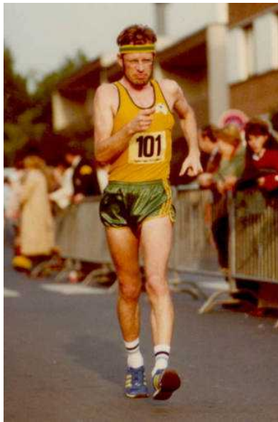
Peter competing in the 1979 Lugano Cup 20km walk in Germany

His last Australian title was the 1980 20 km. He continued to race into 1981 but was nearly 40 years of age by now and realized it was time to step back and let the younger generation take over. His last fling was when he was selected in the Australian team for the 1981 Lugano Cup (his second for Australia and his fourth overall). On this occasion, he opted for the 50 km event and suffered one of his few non-finishes, being DQ'd when struggling in the latter stages of the race.