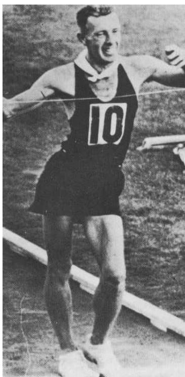
Norm Reid wins the 1956 Olympic 50 km

Passed over by New Zealand and Britain for the Olympic Games to be held in Melbourne in November and December 1956, Read crossed the Tasman and in September won the Australian championship in 4:30:17 , only 2 minutes outside the Olympic record. He was hastily added to New Zealand's team.