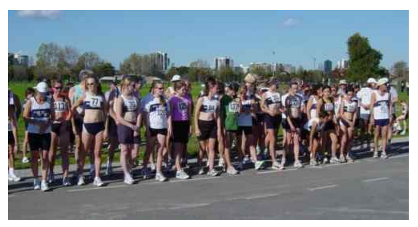
Walkers as far as the eye can see at the start of the Open and Under 15 walks

We had a wonderful turnout of 59 walkers who contested a variety of distances ranging up to 12 km. Given that the AV Country championships were on in opposition this weekend and we were missing quite a number of regulars, that omens well for even bigger fields as the season progresses. The first races at 2:15 saw a huge lineup and part of it is shown in the photo below.