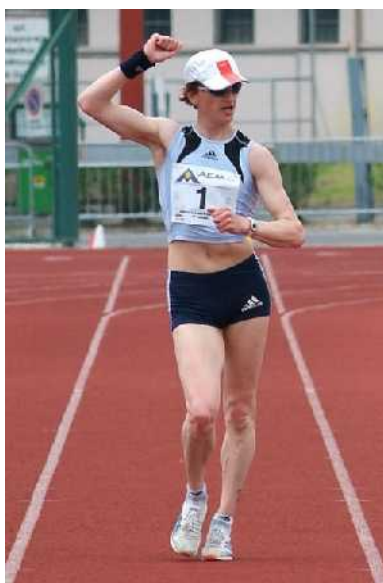
Turava (BLR) approaching the finish line

DNF: FEITOR S, ALMEIDA SAAVEDRA L, SCIACCA A