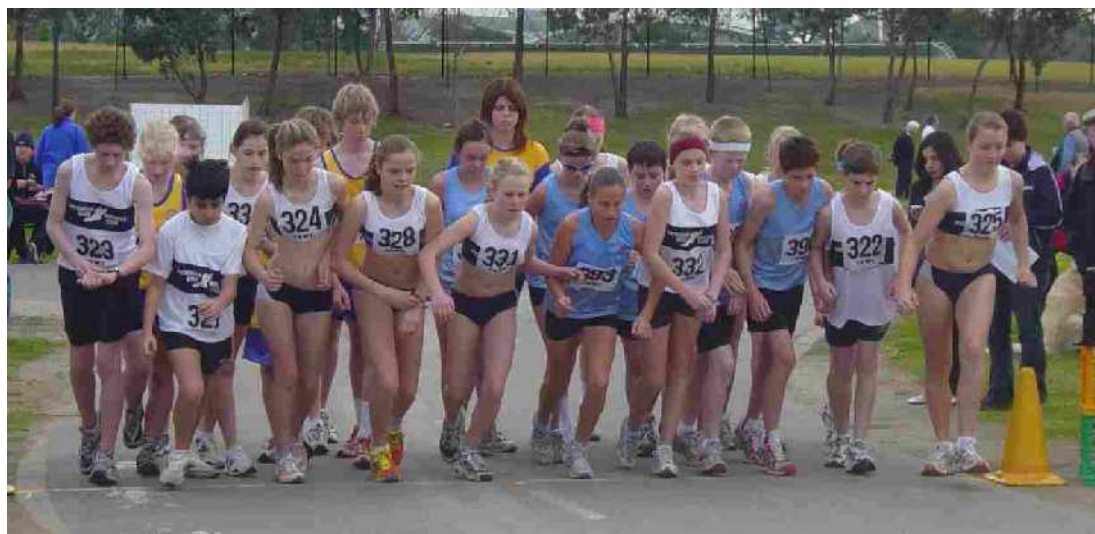
The start of the Under 14 events