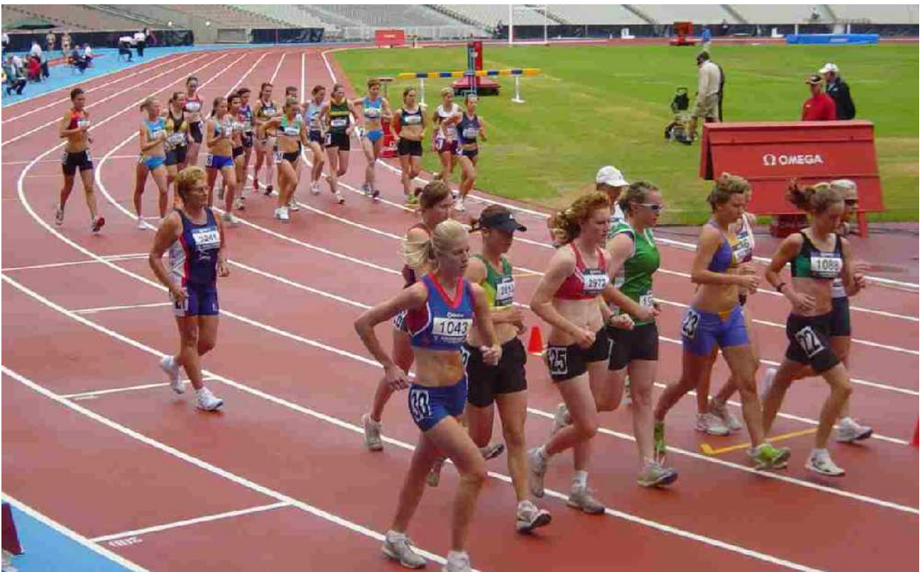
The start of the 5000m racewalk for women