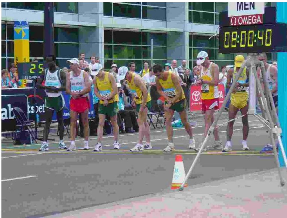
The start – still overcast for not for long

Luckily early morning cloud cover and the morning shadows from the surrounding buildings shielded the walkers for the first half of the race but the second half was walked in the sunshine with the temperature quickly rising.