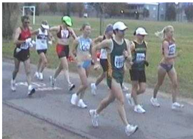
The Open walkers in action on Sunday

The Schools Championships were keenly contested with some very good performances spread over the various age groups. The medals were spread between the metropolitan and country areas with walkers from Geelong, Ballarat and Bendigo showcasing the depth of walking in the State.