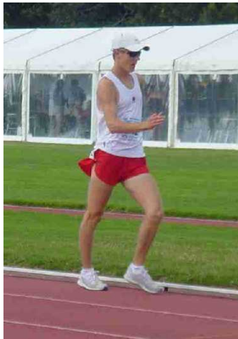
Jared Tallent surges to a PB 5000m time of 19:13.95