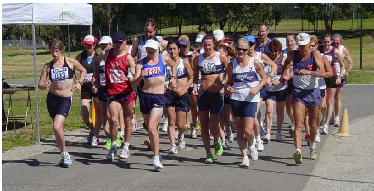
The start of the 10 km and 5 km events

A larger than expected group of walkers ascended upon Albert Park last Sunday morning for our last Sunday event before the end of the year and there were some good performances on show.