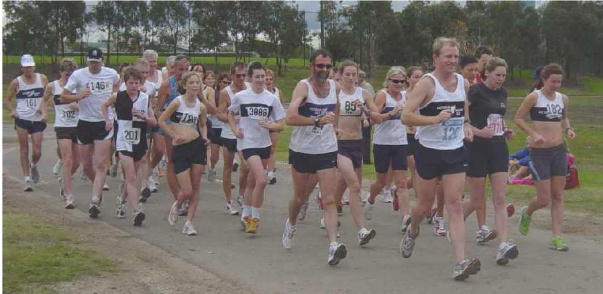
The start of the Open events