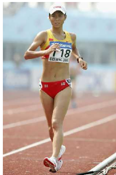
Chinese gold medallists Xiangdong Bo and Hong Liu