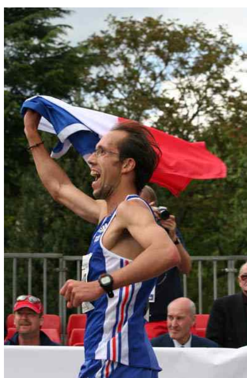
20 km winners Ryta Turava and Yohann Diniz