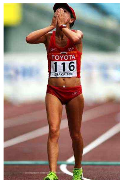
Medallists Olga Kaniskina (101) - RUS, Tatyana Shemyakina (111) – RUS, Maria Vasco (116) – SPA