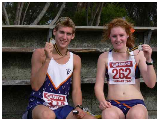
Two silvers head back to the Bendigo area