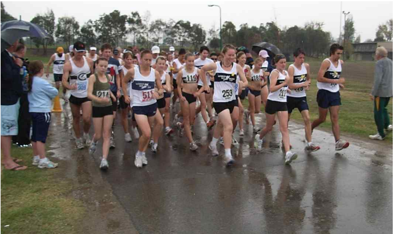
The start of the Open and Under 15 divisions. Make room! Let me through!