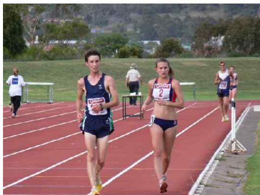
Our Two Junior Champions