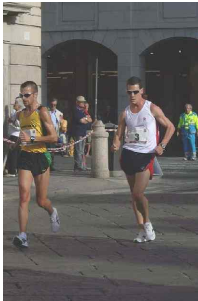
Nathan Deakes and Ivano Brugnetti race over the cobblestones in the Pino Dordoni Memorial International

Deakes, along with Luke Adams and Jane Saville, are scheduled to compete in the 2007 IAAF Race Walking Challenge Final in Saransk, Russia this Saturday. A preview will be posted on athletics.com.au later this week.