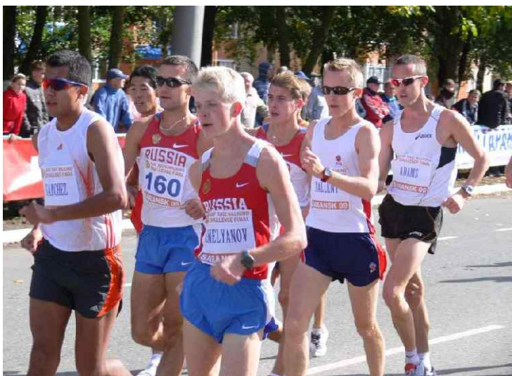
The main pack early