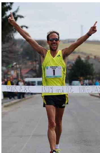
Diniz crossed the finish line in Dudince ( http://www.iaaf.org )

In the 20 km men's race Jakub Jelonek of Poland registered an impressive win, missing his PB by only 1 second with 1:22:58. Serbian Vladimir Savanovic won the new 35km U23 category 35 km (2:46:14), while the junior 10km race witnessed high quality performances with David Tomala of Poland (42:12) defeating German Hagen Pohle (42:19) to clinch the title.