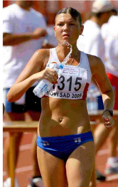
The two winners in action ( http://www.european-athletics.org/ )