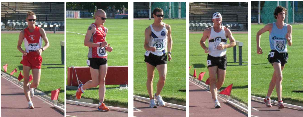
Jared Tallent, Chris Erickson, Tom Barnes, Stuart Kollmorgen and Rhydian Cowley