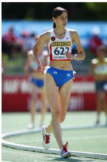
Winner Elena Lashmanova of Russia