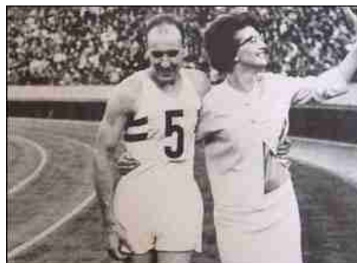
and was then embraced by his wife in a moment that was captured for posterity