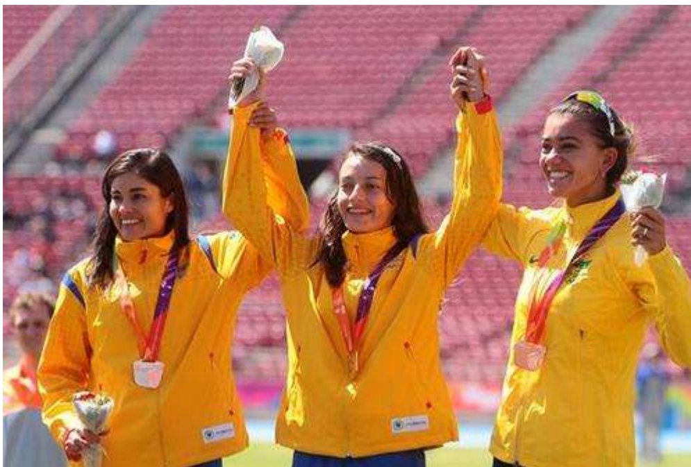
The women's 20,000m race walk podium at the ODESUR Games (© Copyright Giovani Dos Santos)

http://omarchador.blogspot.pt/2014/03/eider-arevalo-conquistou-medalha-de.html