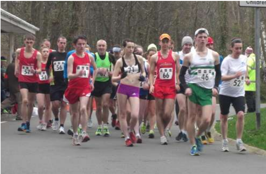
Left: 20k/10k start