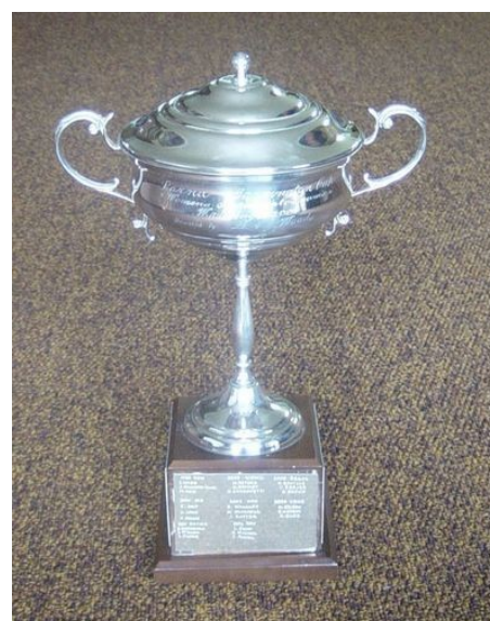
Lorna Carrington Cup