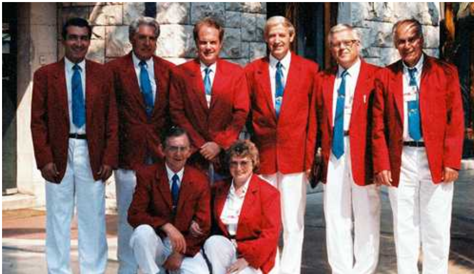
1990: The judges in the 1990 European Championships in Split