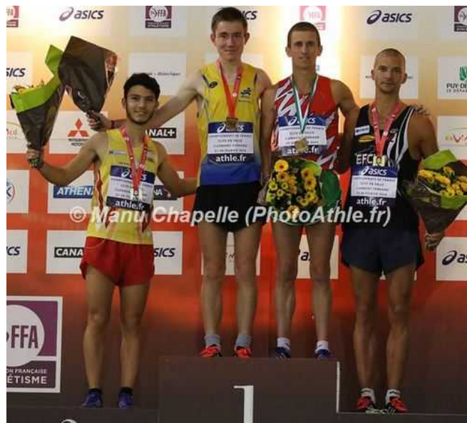
Podiums in the French Indoor Champs