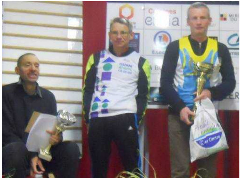
Right: The men's podium after the event – somewhat the worse for wear