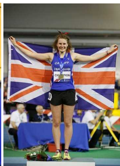
Tom Bosworth and Bethany Davies win again