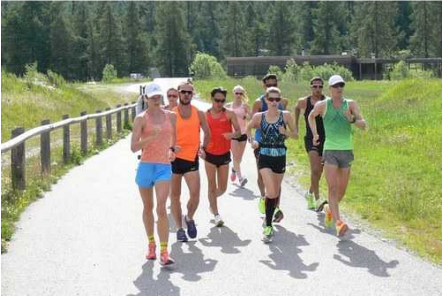
And off they go again!