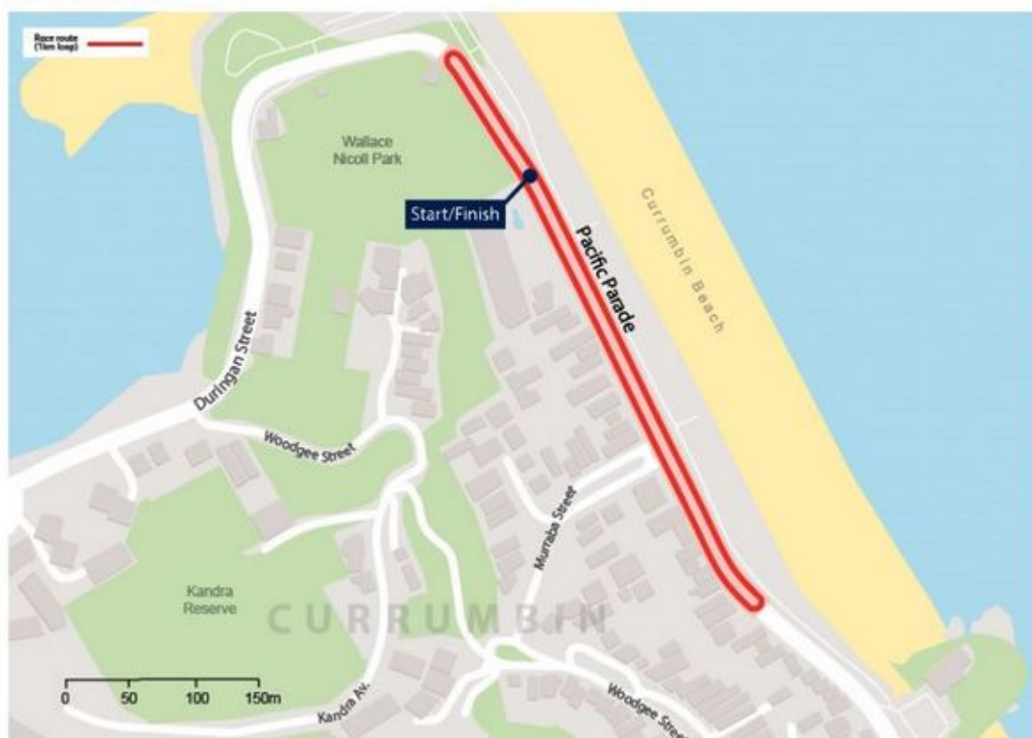
Race Walk Course

You can also see video of all 3 courses at https://www.facebook.com/gc2018/videos/1370264119702790/ .