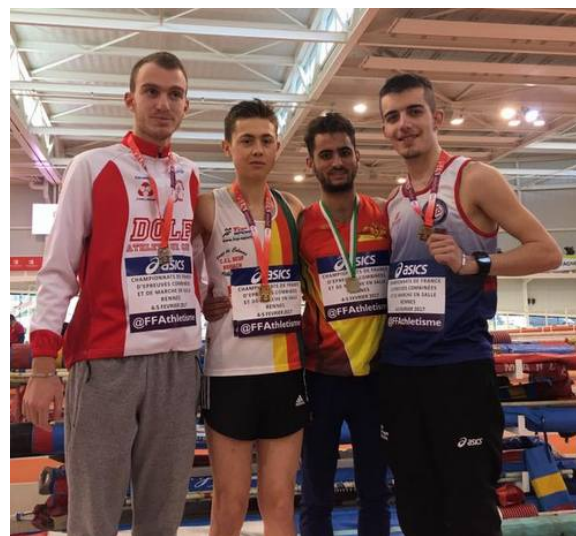
U20 podiums