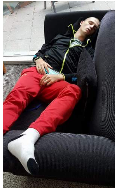
It's hard work for a young bloke sometimes