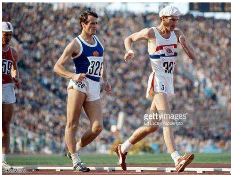
English walker Paul Nihill leads eventual winner Peter Frenkel of East Germany in the 1972 Olympic 20km

The racewalking stamp is a direct copy of a famous 1972 Olympic 20km photo showing East German Peter Frenkel (the eventual winner) and British walker Paul Nihill. Here is the photo