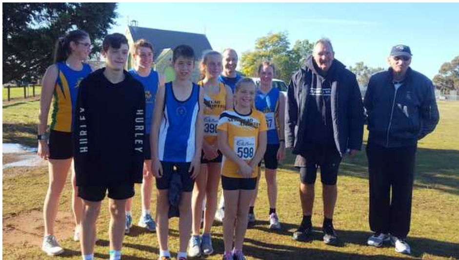
All the walkers from the Tasmanian Roadwalks Champs