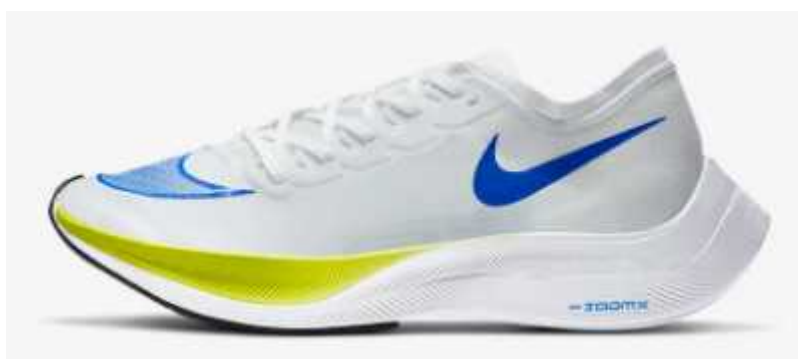
Nike Air Zoom Vaporfly - the first sub-2-hour marathon

In recent years, professional cycling has seen huge improvements in bike design, via steamlining, light weight materials, etc. Swimming also experienced a similar seismic shift in performance when high-technology swimwear was designed to reduce drag and improve swimming performance - so much so that eventually full body swim suits had to be banned from major competition. Now running is experiencing that same seismic shift in performance as a result of advances in shoe design. A revolutionary new road running shoe design has led to the first sub-2-hour marathon, while a revolutionally new spike design has led to a plethora of new track based running records over distances which include 10,000m track, 5,000m track and 1 Hour track.