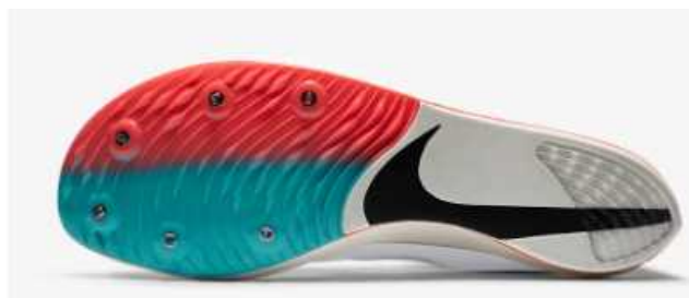
Nike ZoomX Dragonfly spikes, billed as the "fastest shoes ever".