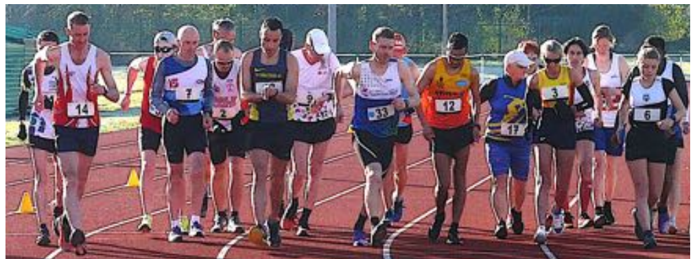
Underway at Conflans ... not much warmth in that morning sun.