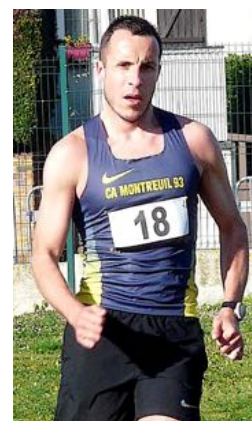
Berchebru, 2 nd