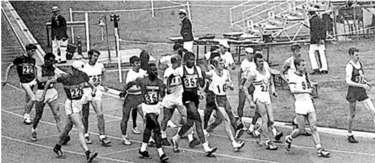
Start of the Edinburgh 20 miles. (You'd hope for the sake of No.9's lower back that it's just a camera distortion!)

"It was an unforgettable Major Championship Race Walk in so many ways with a multi-nation field of 21. In the Trial some 6 weeks earlier I was 9th in 2.47 and had to take 10 minutes off the time to gain my coveted Bronze Medal. I firmly believe if there is a will there is a way. If you believe in yourself on the day, that matters most."