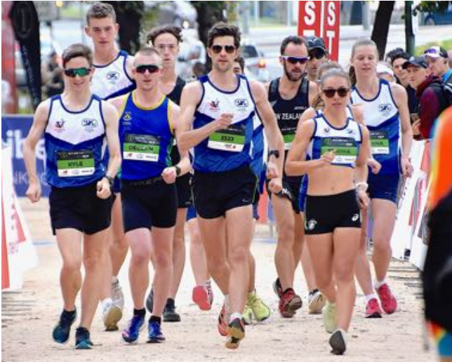
Gangway! Elites on the march