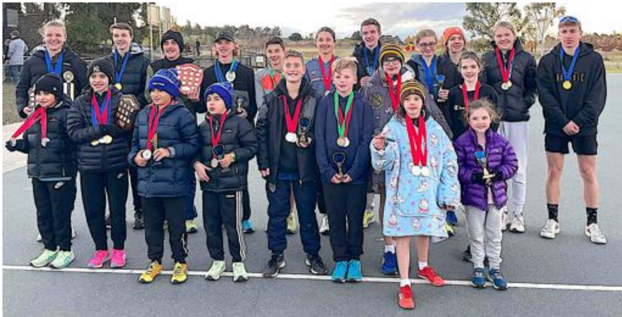
Worth their weight in bling ... the mighty Vics!

Well done to all members who made the journey to compete and support the big 'V', whatever your placings. A special thanks to those who volunteered for the wide range of roles and tasks necessary to successfully hold such an event. We hope you all enjoyed the trip, returned home safely and are rarin' to go for the "Guess Your Time" races this weekend!