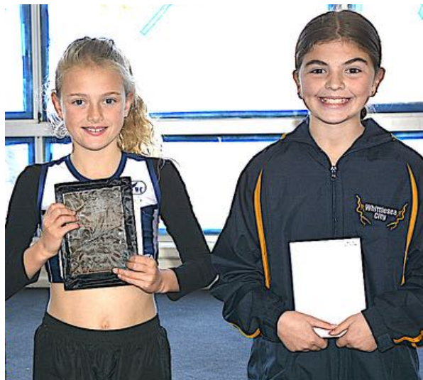
U12 grinning contest!