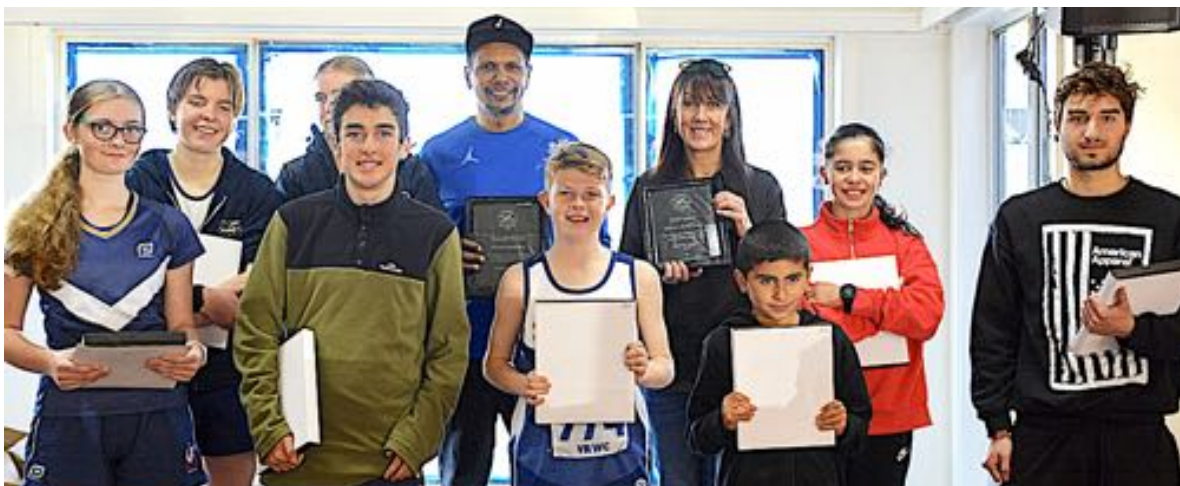
Fastest times & handicap winners