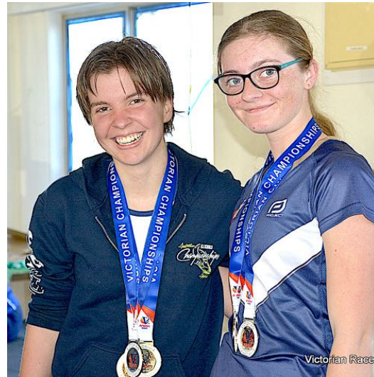
Happy bling racks, finally wearing Teams medals