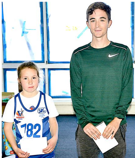
The long and short of it (or the other way around?)