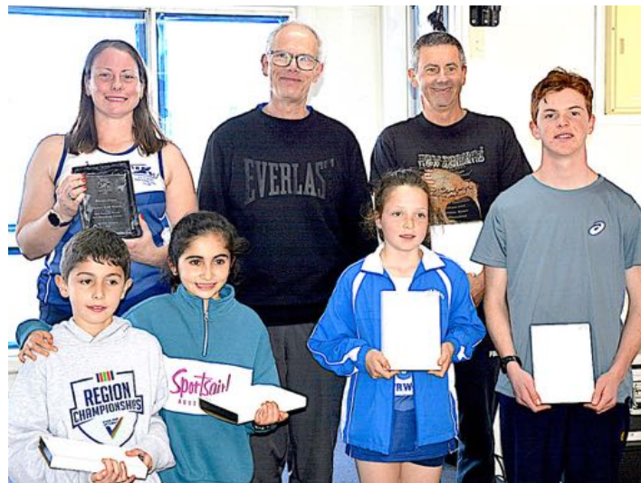
Fastest time & Handicaps 2 nd and 3 rd placegetters