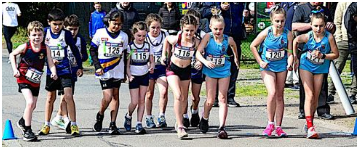
Hop out of the way! These U10s take no prisoners!