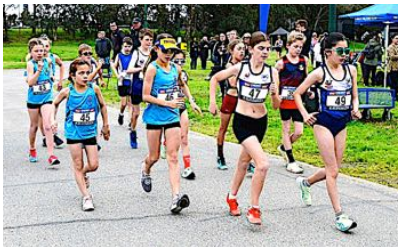
U12 2km ... a guaranteed fast start!