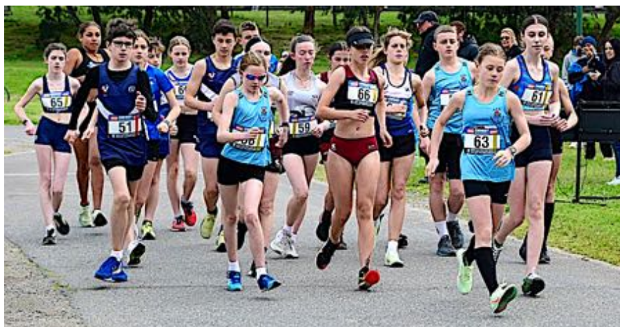
The U14 3km ... a PB party!