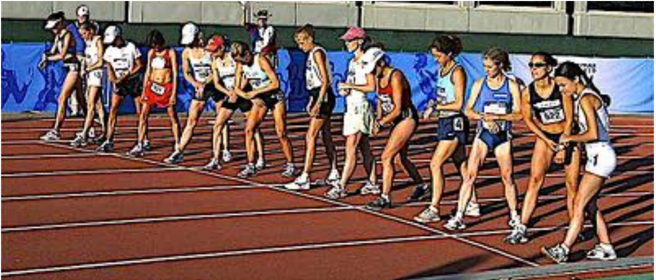
'On your marks'. Who is showing the best pre-start posture?