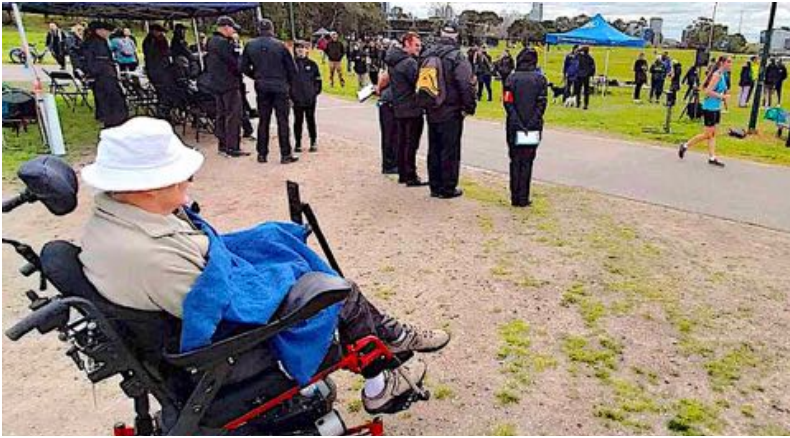
Once a judge, always a judge ...