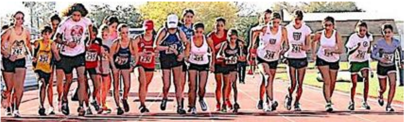
'Go!' Who you think has started correctly here?