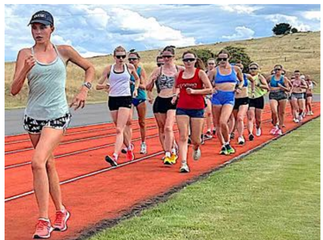
Hill reps and track sessions in rare air.