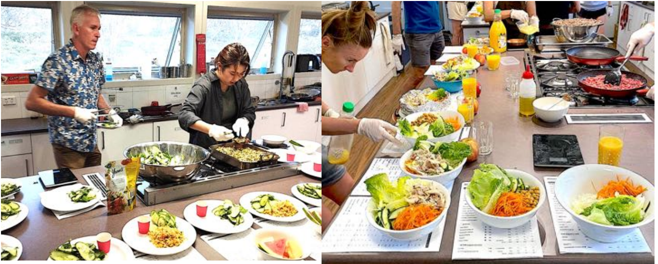
The 'guts' of the study ... each portion measured to the milligram.