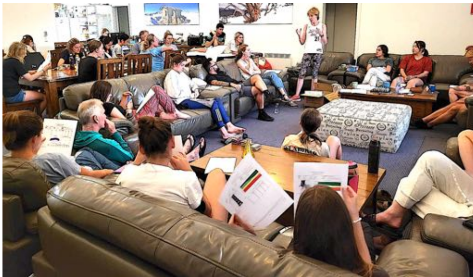
Did they know they'd be hit with an essay to write afterwards?