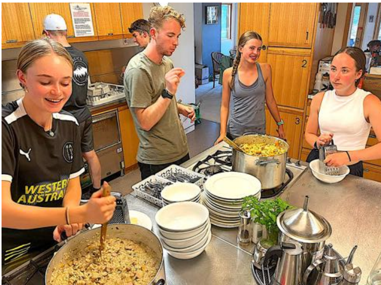
'Mm ... maybe just a tad more monosodium whattheheckisitmate?'