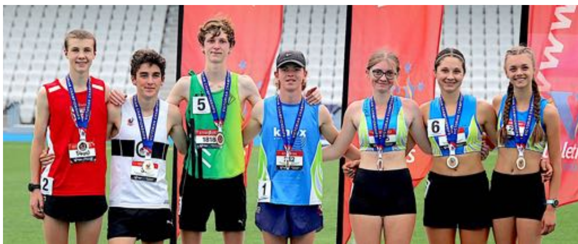
Well done, everyone!