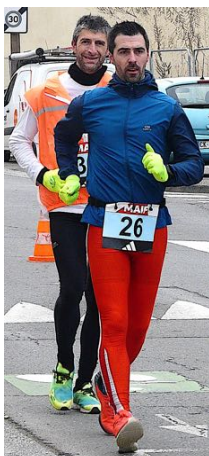
Letourneau & Forestieri