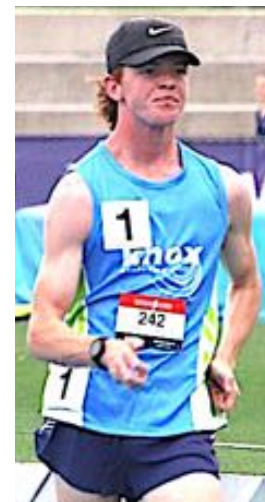
U17/18 5000m ... small field, big results.