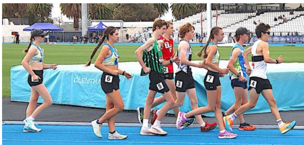
A much cooler morning start for the U17/18s.