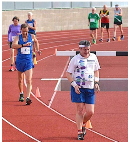
... and not forgetting 'l'homme lui-même'.