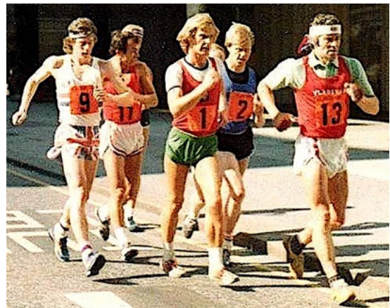
Ed (not sure which one he is) contesting the 1980 50km Olympic trial

The Sacramento success (6th in 5km track, 3rd in 10km, 1st in 20km) owe a lot to the extra sharpness of daily track workouts, a 15-minute walk from son, Andrew’s home with about an hour of 400m flat out, 200m at recovery pace, straight into the next rep. Happy days!”